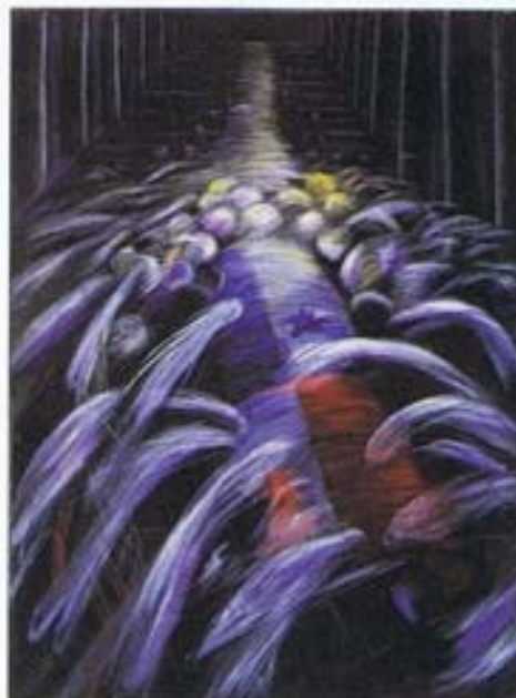
Muerte en la Catedral (Death in the Cathedral-from Panama Series), 1988.